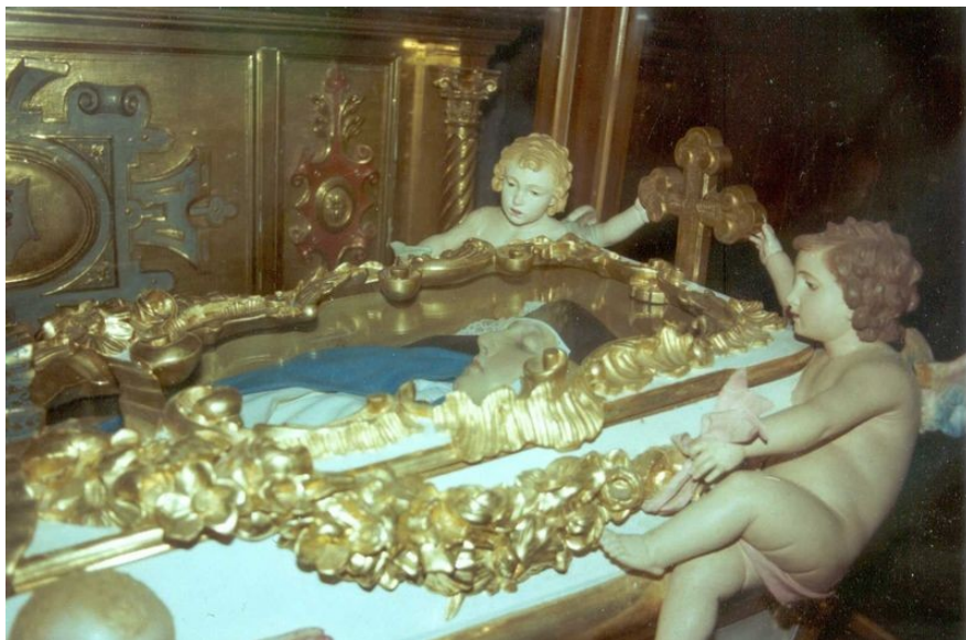
Incorrupt body of Mary of Agreda, in Agreda, Spain